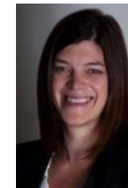
Covenant Secretariat Executive Director