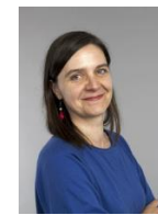
Founders' Council Rotating Seat (TBD)