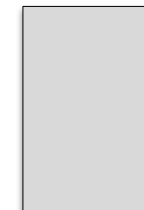
Finance Council (TBD)