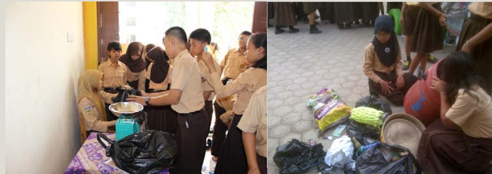
Bank Sampah Sekolah

Jambi City's Mayoral Instruction Nomor 660/736/BLH/2014 for Establish every school to create Waste Bank