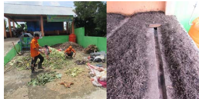
Traditional market waste

inorganic waste reduction by supporting, facilitating and providing technical, management, skills and equipment assistance to community initiatives