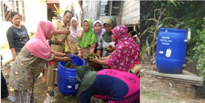
Household scale composting