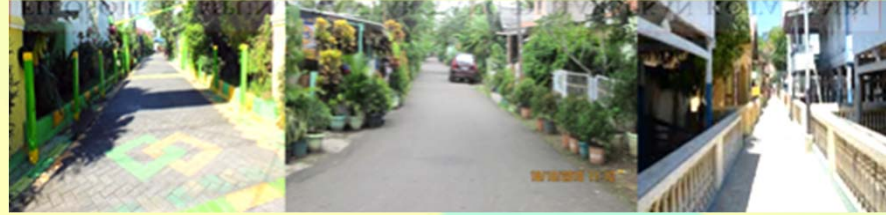
Bantar Village: “Clean, Safe & Smart”