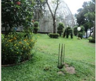
Ulp er Sdunv