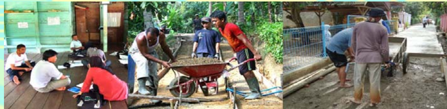
Bangkit Berdaya “Intensively Developing Subdistricts with Community Efforts”