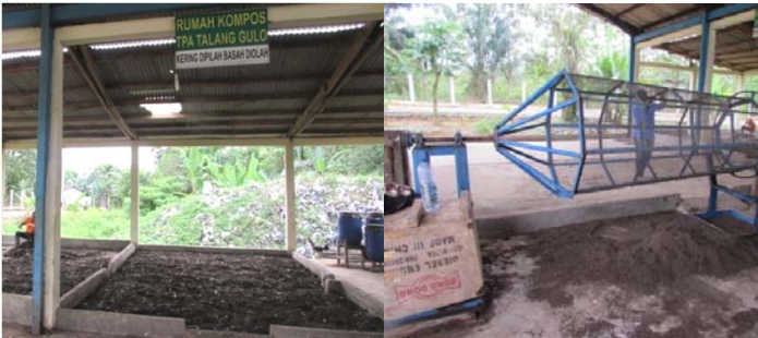
Composting in landfill