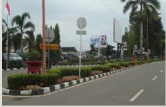
J uhhq#P hg.lbg# Sdunv