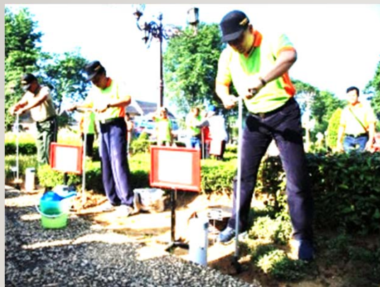
Planting 1,000 trees